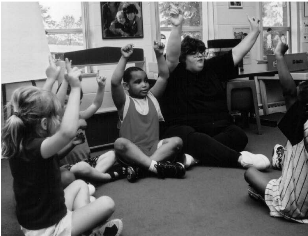
At the line “The clock struck one,” children hold up one finger or make a chiming sound.